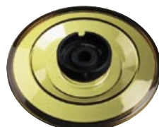
lid 2425 with bio-containment 2) , autoclavable