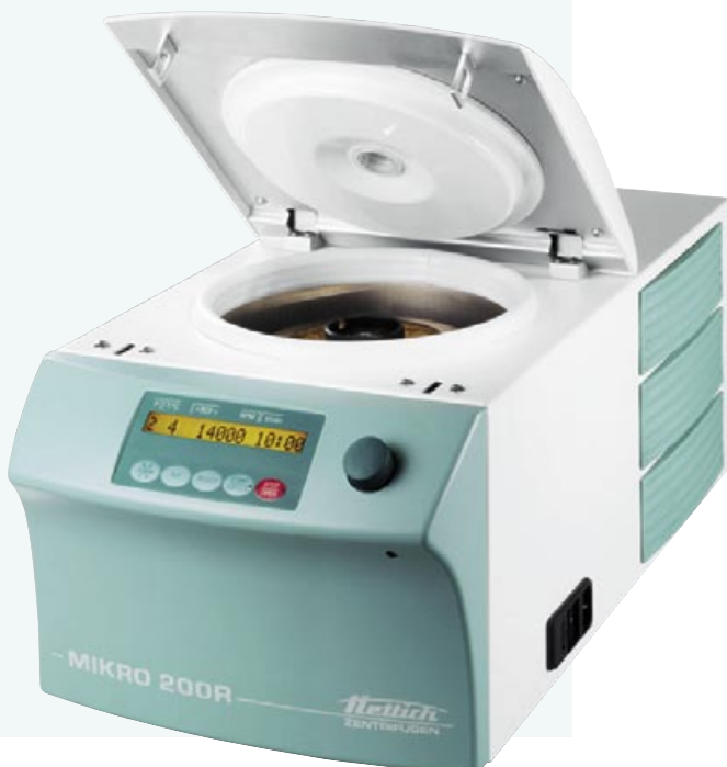
MIKRO 200R cooled