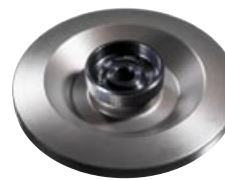
lid 2423 with bio-containment 2) , autoclavable, phenol-resistant