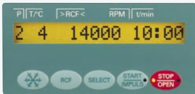
MIKRO 200 R control panel

Even thermosensitive samples can be gently centrifuged thanks to highly reliable refrigeration. Best separation results are guaranteed with the smooth-running, high-performance motor featuring a maintenance-free frequency drive. With the autoclavable and aerosol-tight accessories, even infectious materials can be processed safely for both the user and the environment.