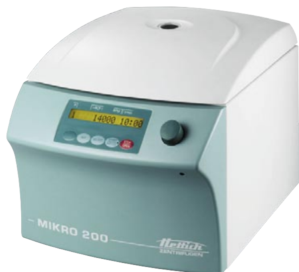
MIKRO 200 classic